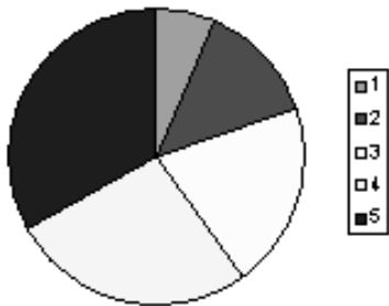
c) Sample Graph # 3